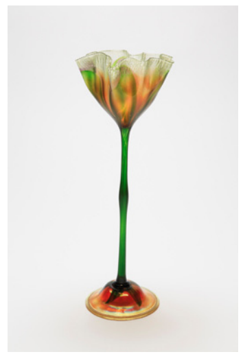
Louis Comfort Tiffany, Floriform Vase, c. 1900. Glass. Harvard Art Museums/Fogg Museum, Gift of Murray Anthony and Bessie Lincoln Potter, 1957.43. (On view at the Harvard Museum of Natural History, in the Glass Flowers gallery.)