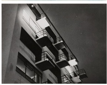
Lyonel Feininger, <u>Untitled (Ghosties)</u>, c. 1954. Black ink and watercolor pencil on white paper. Harvard Art Museums/Busch-Reisinger Museum Bequest of William S. Lieberman, 2009,100.85.

Lyonel Feininger, <u>Bauhaus</u>, March 26, 1929. Photograph. Harvard Art Museums/Busch-Reisinger Museum, Gift of T. Lux Feininger, BR71.21.23.