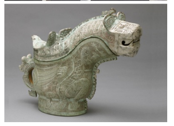
Pablo Picasso, <u>Mother and Child</u>, c. 1901. Oil on canvas. Harvard Art Museums/Fogg Museum, Bequest from the Collection of Maurice Wertheim, Class of 1906, 1931-57.

Max Beckmann, <u>Self-Portrait in Tuxedo</u>, 1927. Oil on canvas. Harvard Art Museums/Busch-Reisinger Museum, Association Fund, BR41.37.