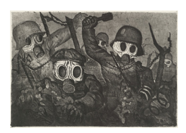
Otto Dix, <u>Assault Troops Advance under Gas</u>. from the series <u>Der Krieg</u>, 1924. Etching and aquatint. Harvard Art Museums/Fogg Museum, Friends of the Fogg Art Museum Fund, M12404.

The installation is made possible by funding from the Harvard College Program in General Education and the Art Museums' Gurel Student Exhibition Fund.