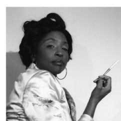
Image: detail of a work entitled 1957-2009 Interior, 2009. Harvard Art Museum, Margaret Fisher Fund.