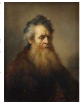
Rembrandt van Rijn, Portrait of an Old Man, 1632, Oil on panel, Harvard Art Museum/Fogg Museum, Bequest of Nettie G. Nauenburg, 1910, 191.