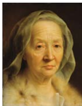
Christian Seybold, Portrait of an Old Woman, 1748-50, Oil on copper, Harvard Art Museum/Fogg Museum, Alfred Jarecki Fund, 1971, 19.